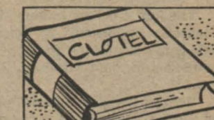
CLOTEL, published in London in 1853, was the first published novel written by an American Black, William Wells Brown.