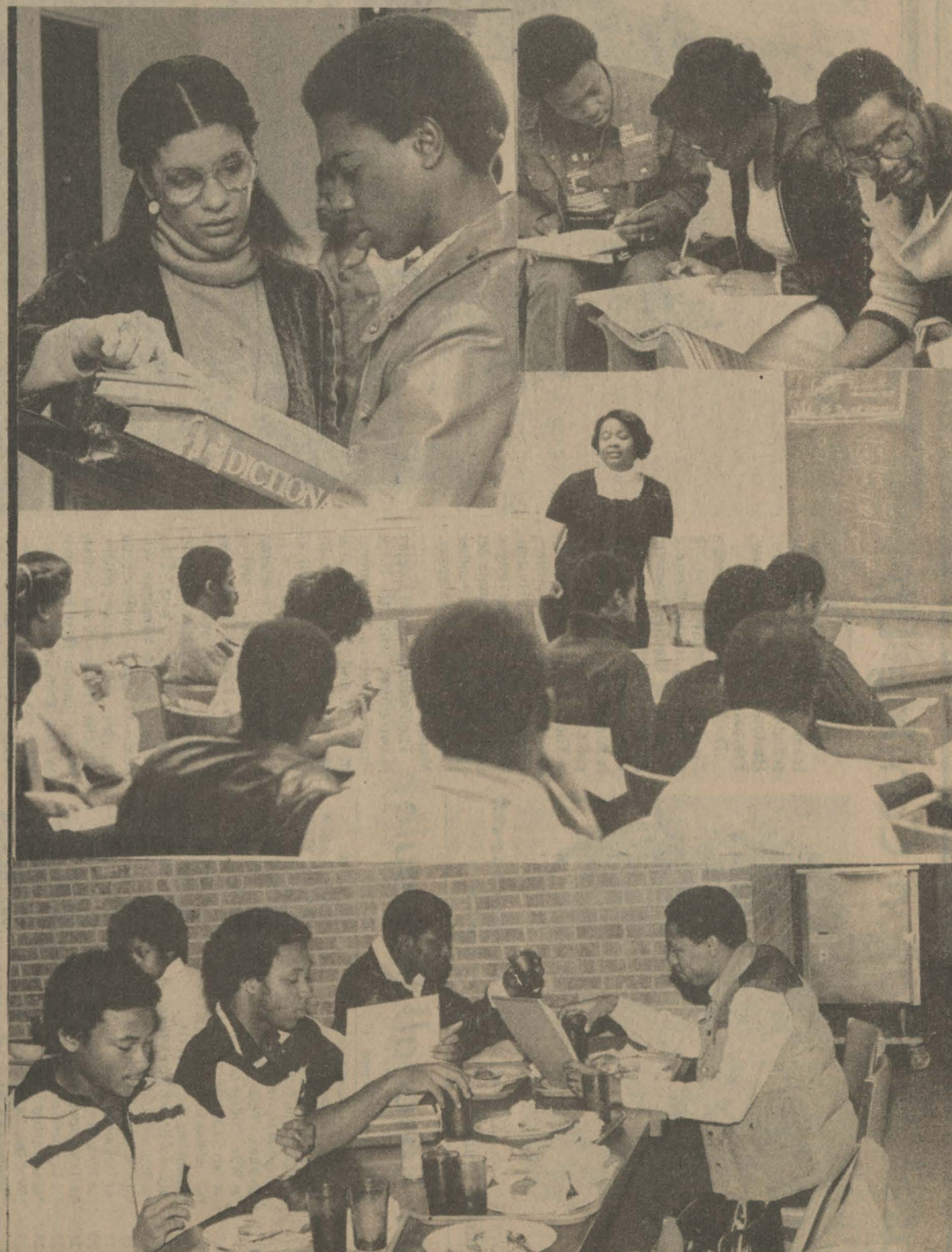
Students and Staff are pictured at work in location across the campus.