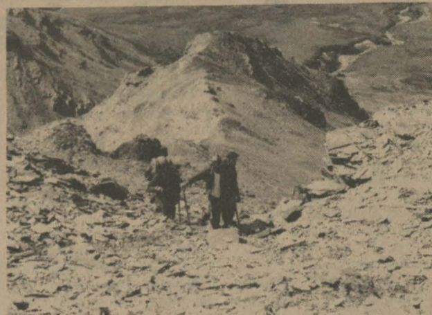
ALASKA WILDERNESS SCENE.

CASS Student Advertising, Incorporated 1633 West Central, Evanston, Illinois 60201