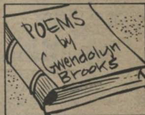
The first Black to win a Pulitzer prize for poetry was Gwendolyn Brooks in 1950.