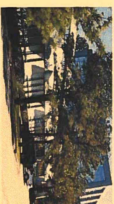
Prairie View A&M University Northwest Houston Academic Center