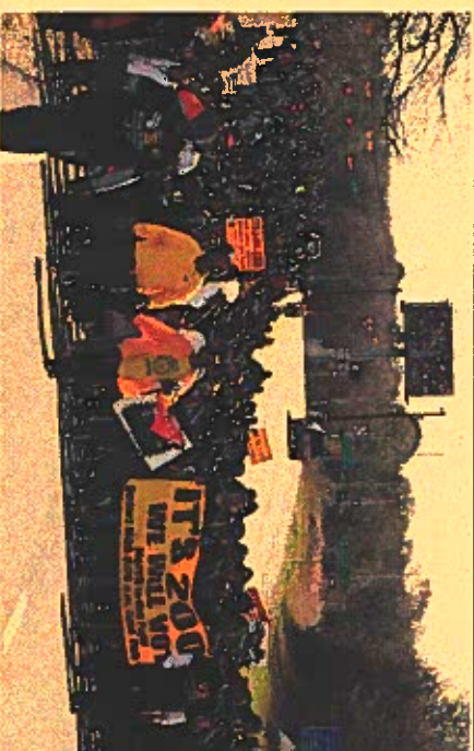
Prairie View Students on the Internet for 2008 election

In February over a thousand students marched 7.3 miles to the county court house in Hempstead to use the two voting machines available for early voting. As evidenced from this Flickr photo and the accompanying You Tube video on the Burnt Orange report website, Prairie View students displayed determination that made national history.