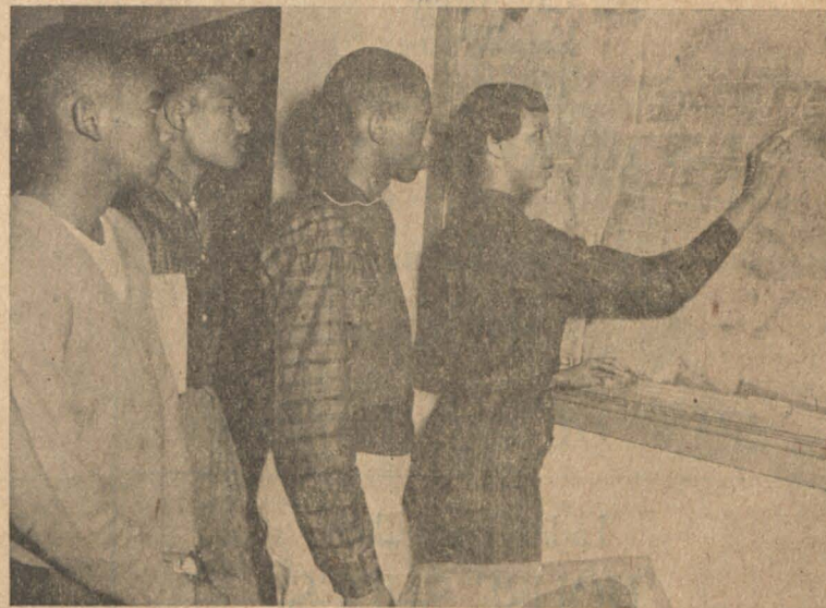
YM-YWCA TUTORING SERVICE IN ACTION

Last year 538 students joined the campus YM-YWCA organization, and 36 activities sponsored by the group attracted a gross attendance of over 4,000.