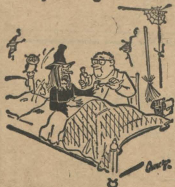
"Ugh! What kind of witches' brew is that!?"