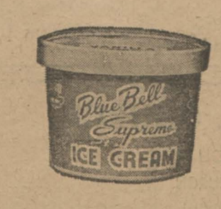
Blue Bell Creameries

The title is — "A Technique for Sectioning Freshwater Monogenetic Trematodes."