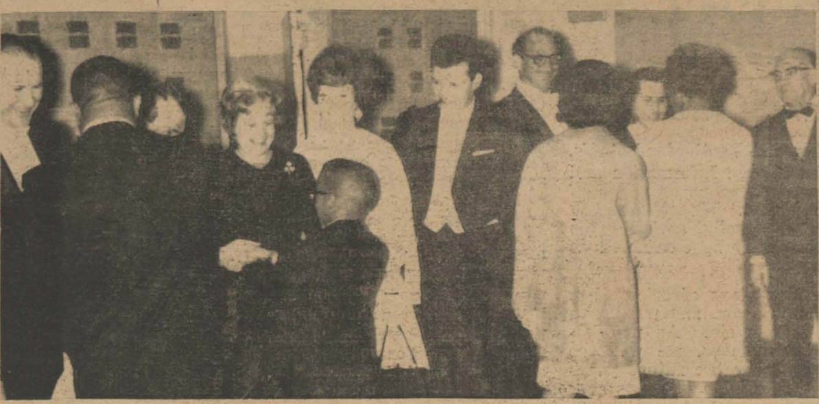
CULTURAL EVENT - Hundreds attended the reception honoring members of the Brass Quintet of Houston following their concert in the Health and Physical Education and