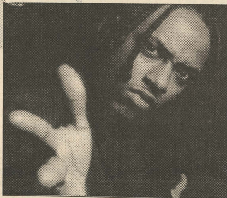
Rap Artist, Mystikal