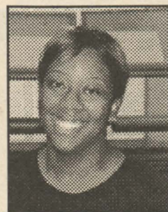
By Sheleah Hughes Editor-in-Chief

Number of overweight people increases while thin is still in