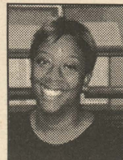
By Sheleah Hughes Editor-in-Chief

staple that many African Americans watch every night in search of current events, comic relief and political insight about their communities.