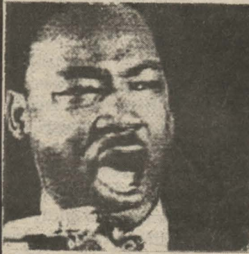
Dr. Martin Luther King

MLK was honored with parades, prayers, and speeches