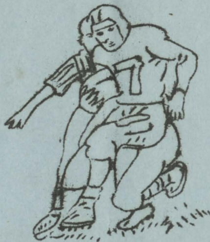
DALLAS FAIR GAME October 19