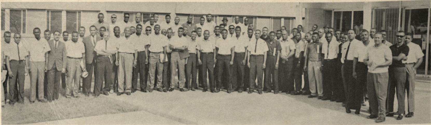
TEXAS COACHES ATTEND ANNUAL PV CLINIC — The above photo shows the large number of Athletic coaches who attended the