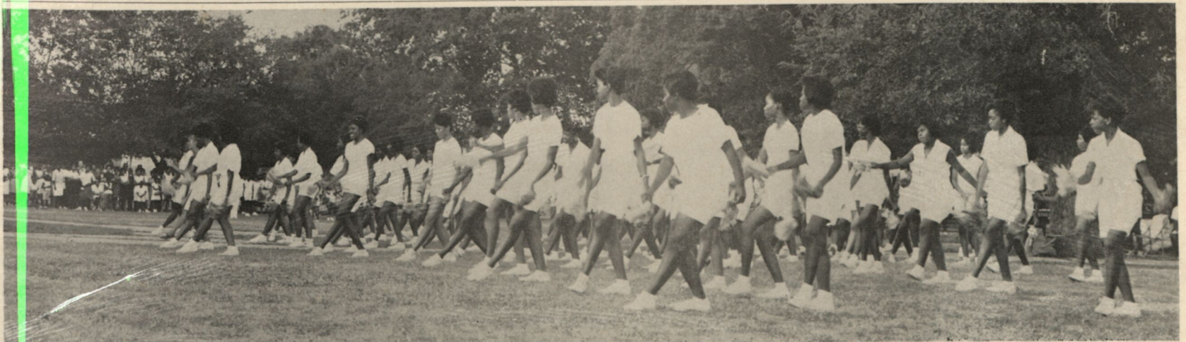
CHEERLEADERS AND MAJORETTES — Over 500 high school students attended the six-day training program held at the college in July.