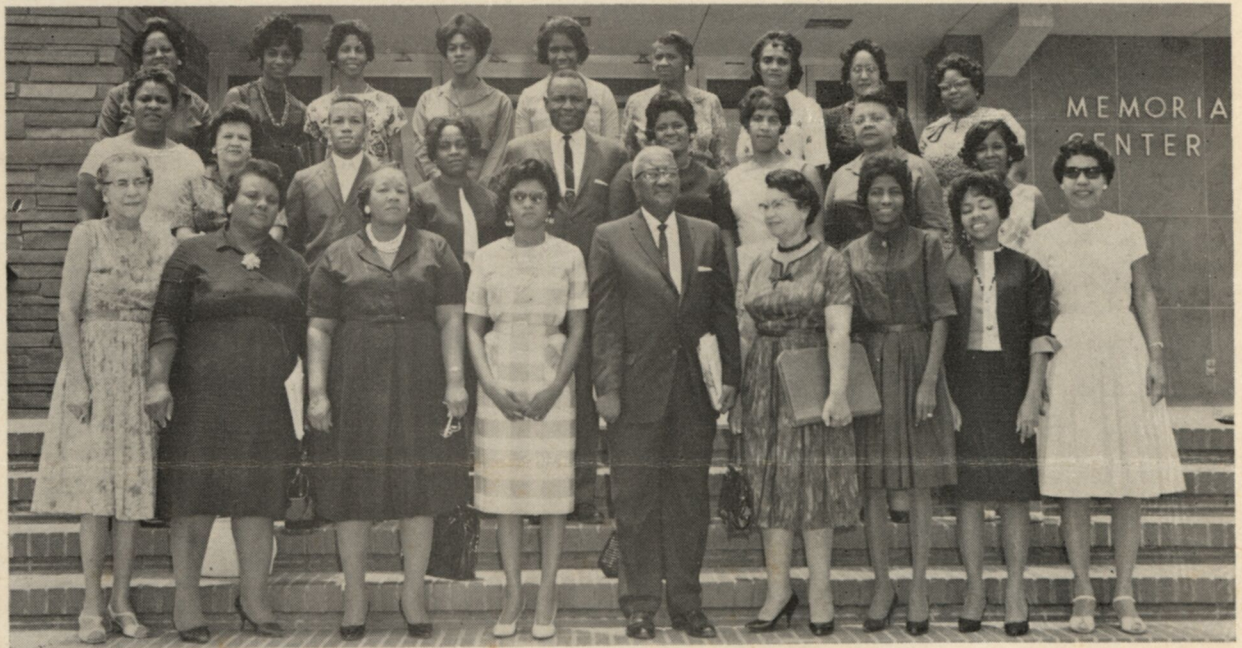
LANGUAGE ARTS WORKSHOP PARTICIPANTS — Twenty-five teachers and administrators participated in the three-weeks workshop held at the college during the Summer Session.