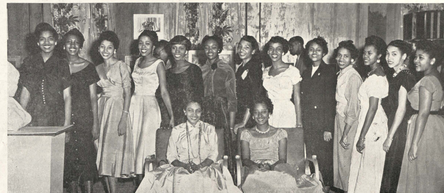
Broad smiles adorn faces of members of Les Belle Lettres Cultural Club. They posed during an Art Exhibit sponsored by the organization, recently.