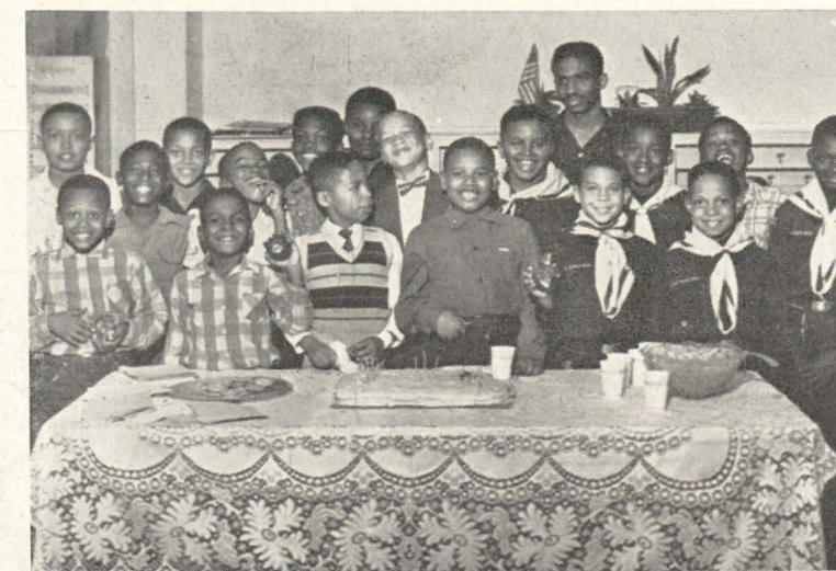
FUTURE E. B. EVANS TROOP MEMBERS are these Cub Scouts, Pack 141, who held a celebration of the 45th anniversary of Boy Scouts, recently.

stated, "Reading and writing — basic language arts, also — are a two-way responsibility. Teachers alone, cannot do the whole job; parents must help."