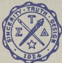
SIGMA TAU DELTA