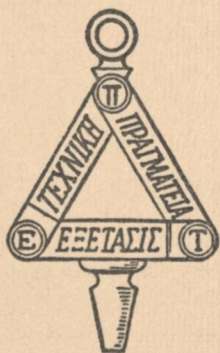
EPSILON PI TAU

The purposes of Epsilon Pi Tau are found in the Greek words TEXNIKH , PRAGMATEIA , AND EXETASIS . TEXNIKH stands for the development of technical skills . PRAGMATEIA stands for social efficiency , both among individuals and in the broader relations of the Industrial Education profession. EXTASIS stands for research . It is the function of the fraternity to publish and circulate reports of scholarly endeavors.