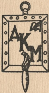
ALPHA KAPPA MU