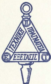
EPSILON PI TAU

The purposes of Epsilon Pi Tau are found in the Greek words TEXNIKH , PRAGMATEIA , AND EXETASIS . TEXNIKH stands for the development of technical skills . PRAGMATEIA stands for social efficiency , both among individuals and in the broader relations of the Industrial Education profession. EXTASIS stands for research . It is the function of the fraternity to publish and circulate reports of scholarly endeavors.