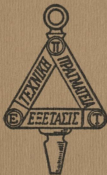
EPSILON PI TAU

The purposes of Epsilon Pi Tau are found in the Greek words TEXNIKH , PRAGMATEIA , AND EXETASIS . TEXNIKH stands for the development of technical skills . PRAGMATEIA stands for social efficiency , both among individuals and in the broader relations of the Industrial Education profession. EXETASIS stands for research . It is the function of the fraternity to publish and circulate reports of scholarly endeavors.