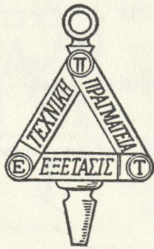
EPSILON PI TAU

The purposes of Epsilon Pi Tau are found in the Greek words TEXNIKH , PRAGMATEIA , AND EXETASIS . TEXNIKH stands for the development of technical skills . PRAGMATEIA stands for social efficiency , both among individuals and in the broader relations of the Industrial Education profession. EXTASIS stands for research . It is the function of the fraternity to publish and circulate reports of scholarly endeavors.