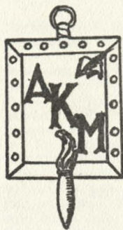
ALPHA KAPPA MU