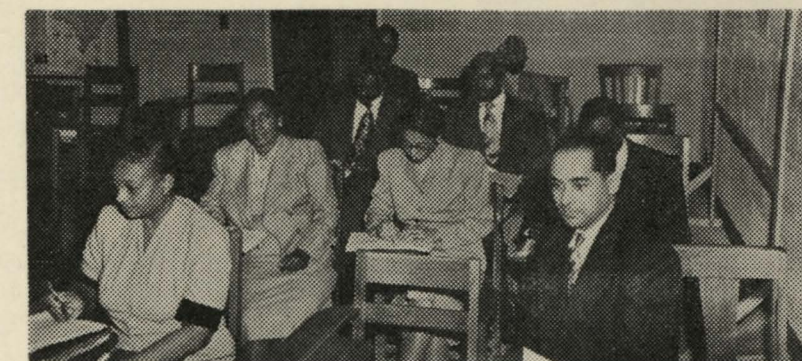
Graduate Group in Supervision of the Elementary School Subjects

Prairie View's Saturday Classes for in-service teachers are creating a great deal of interest in the surrounding area.