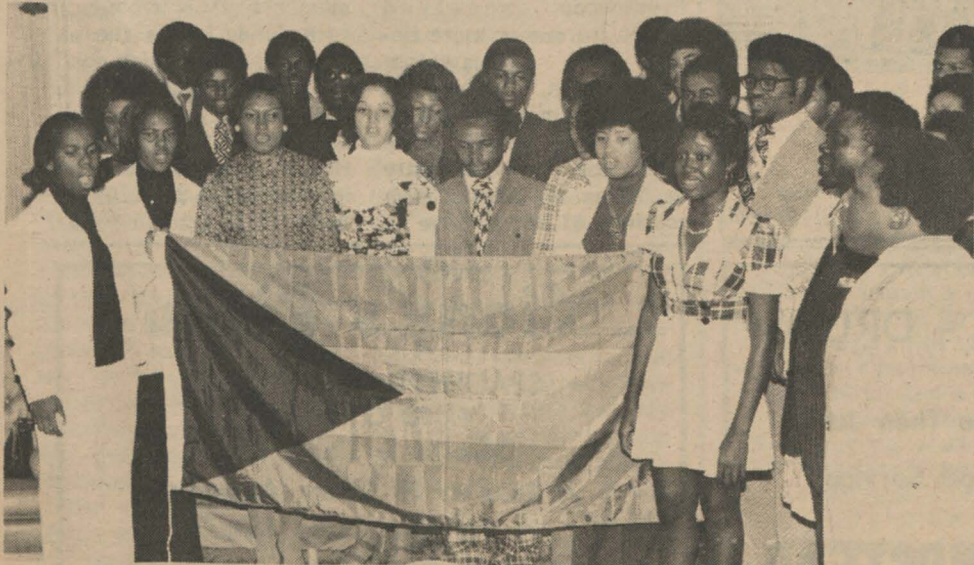
BAHAMIAN STUDENTS and visiting officials sing their National Anthem during social event on campus.