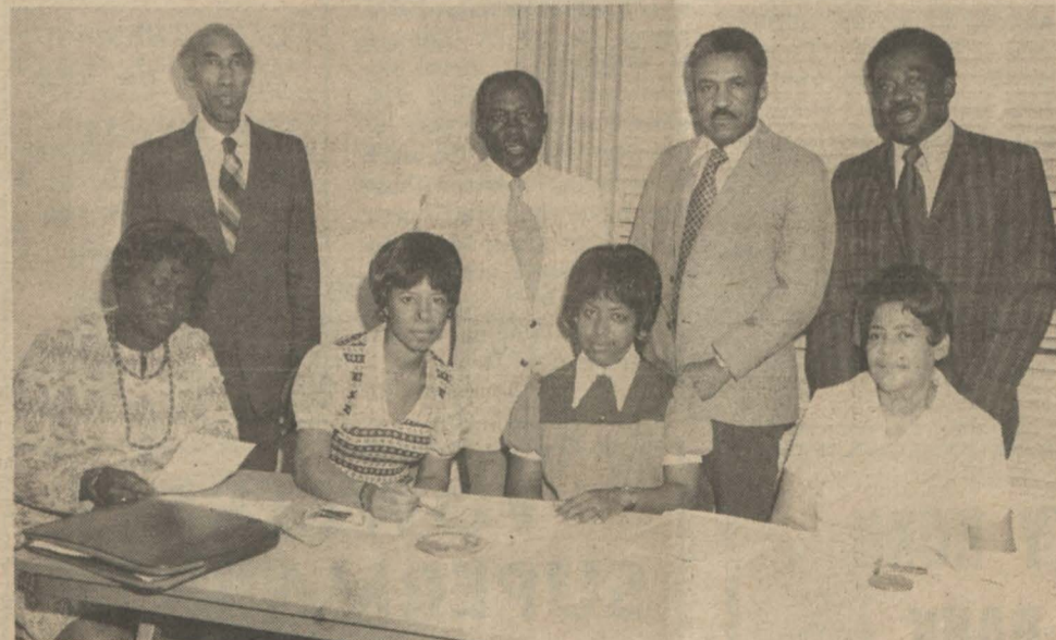
PAGEANT PLANNING — Members of The Steering Committee for the 1974 Miss PRAIRIE VIEW PAGEANT are pictured during a recent planning meeting. The April 25 event promises to be a major highlight of the school year. Seated (L-

5. Lunch: 12:30 p.m. - 1:15 p.m. (Teams will arrange their own lunch See FIELD DAY, Page 7