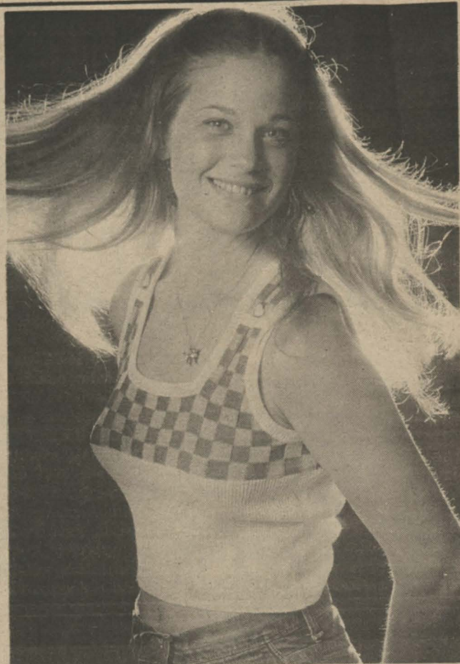
1973 Winning Photo