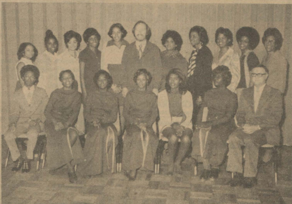
PI OMEGA PI INITIATION — The group photo of participants in the installation ceremonies for Epsilon Omicron was taken following the ex-