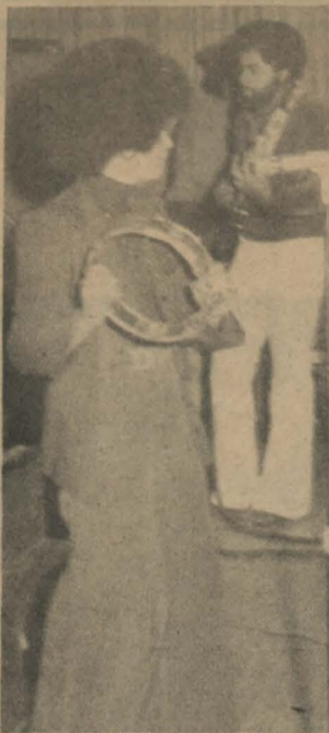
CONCERT — A scene from the recent concert given on campus.