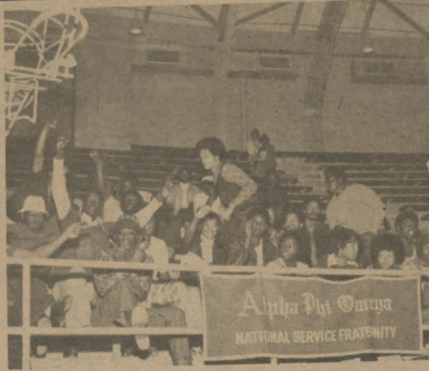
SIGNS OF THE TIME — Alpha Phi Omega Service Fraternity has banner up at opening basketball game in "little dome"... Panthers return to home court in late January.