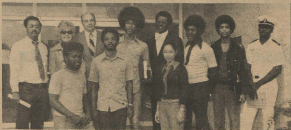
ENGINEERING CONFERENCE with staff member and students during recent meeting.