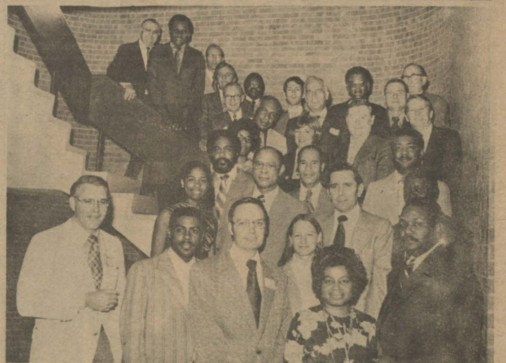
PV CLUSTER GROUP — Members of the PV A&M Cluster (representatives of business and industry) pose for a group photo during a recent campus meeting. They help the University in career planning and placement of graduates.