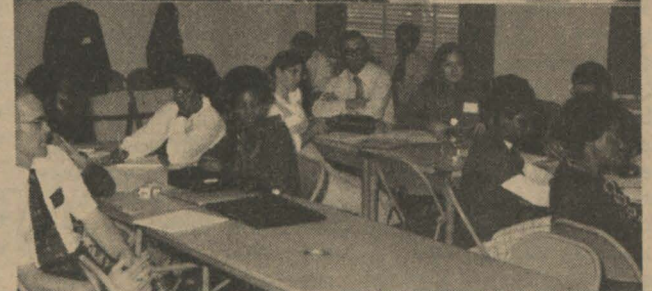
Recreation and program aides and County Extension agents are shown participating in the Family Resource Planning phase of the PV A&M University Cooperative Extension Program.

thrusts of the Prairie View Cooperative Extension Program.