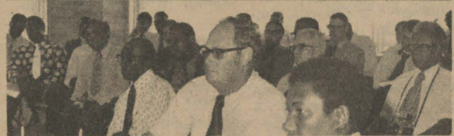
Participants at November Training Conference held on PVAMU campus.