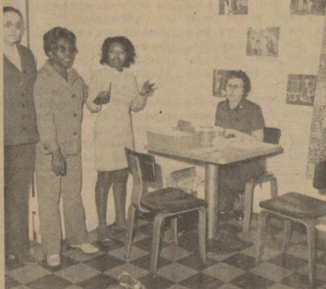
Scenes from Health Clinic sponsored by Deltas.