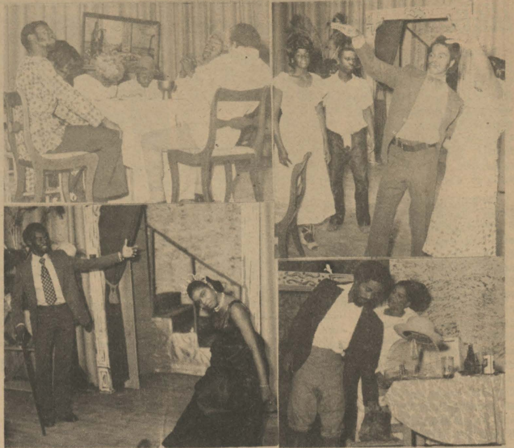
Scenes from recent drama pre-sented by the Charles Gilpin players.