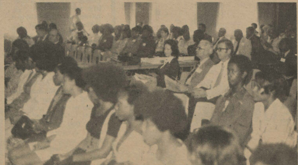
General session school showing extension agents, program aides, and visitors.