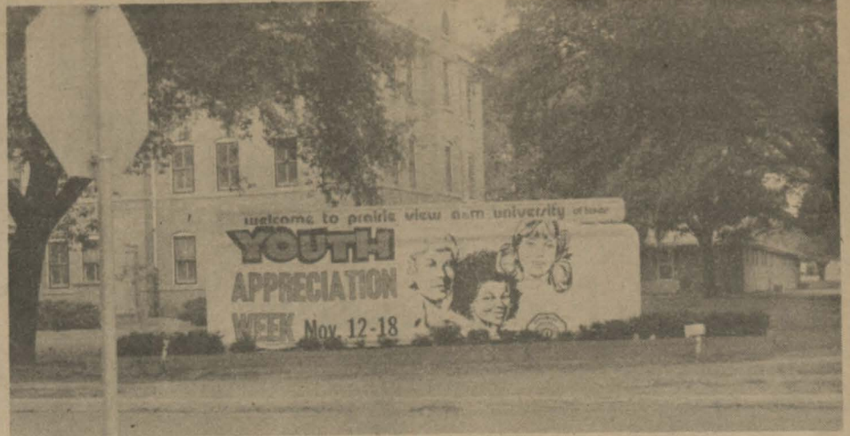
YOUTH APPRECIATION WEEK organization in the promotion of — The Prairie View A&M Optimist Club cooperated with the national Youth Appreciation Week on Nov. 12-18.

Over the past few years, COMGA has been instrumental in providing funds for geographic research on Afro-America and in-