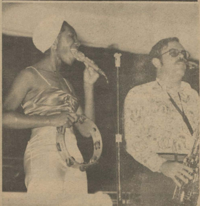
CONCERT — The "Port Authority" group, a U. S. Navy recruiting team, provided top flight entertainment before a packed house.