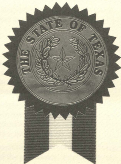
Rick Perry Governor