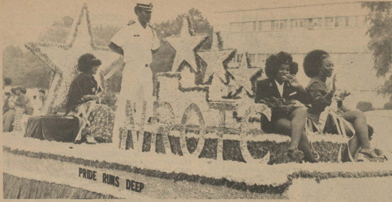
PRIZE WINNING NAVY ROTC FLOAT IN ANNUAL HOMECOMING PARADE.