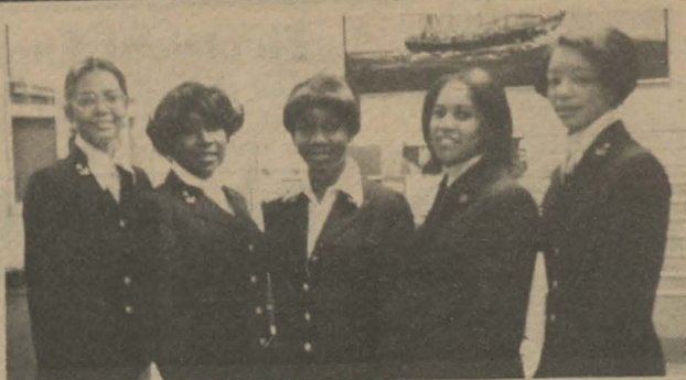
NROTC Anchorettes pose during Rush Party.