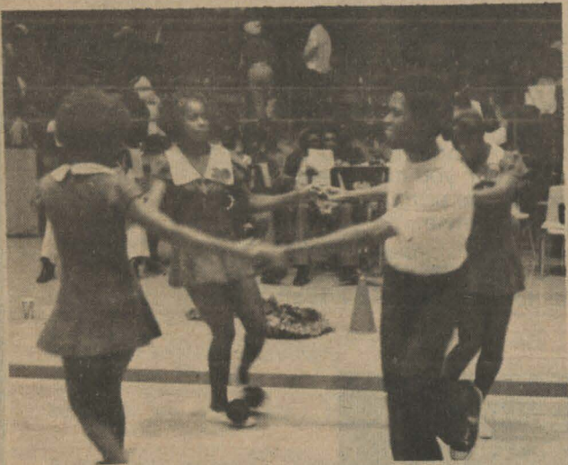
CHEERLEADERS — The familiar group has been active at all home games and deserve much credit for keeping PV spirits high.