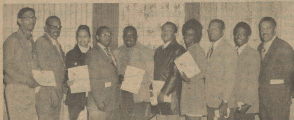
ADULT LEADERS IN SCOUTING — Hempsted-PV-Waller and David Crockett District leaders and advisers all received awards and

Earlier this year, he was elected president of the Federation of Regional Accrediting Commissions of Higher Education. FRACHE is the coordinating agency for the nation's six regional accrediting associations and the National Commission on Accrediting, which serves all organizations conducting professional accrediting work.