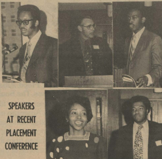
SPEAKERS AT RECENT PLACEMENT CONFERENCE