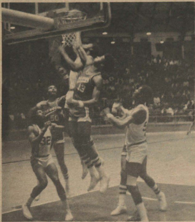
TIGHT ACTION WITH ALCORN A&M — Panthers beat the SWAC cage leaders in the Dome, but lost on the road. Final basketball action for the 1972-73 season was scheduled last week-end.