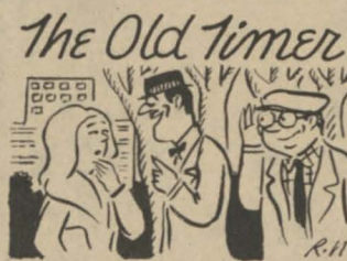
"There's a difference between good sound reasons and reasons that sound good."

The Professional Social Worker produced should be: (1) someone with a deep knowledge and understanding of the Black heritage profile of the Black community.