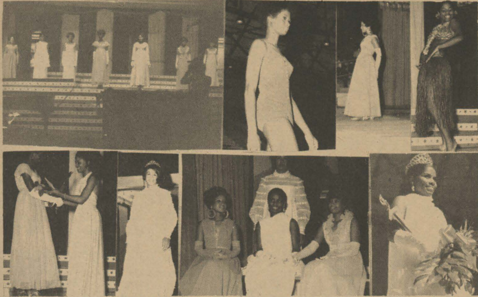
FIRST ANNUAL MISS PRAIRIE VIEW PAGEANT