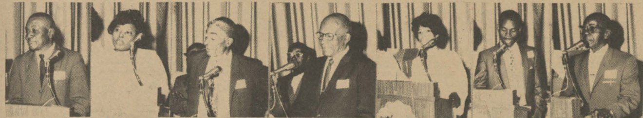
SUPPORT STAFF BANQUET