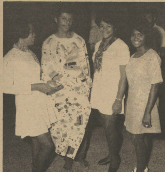
COSMETOLOGY FASHION SHOW