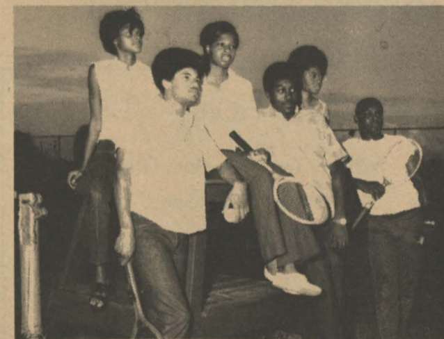
They never have a ... bad time in Levis