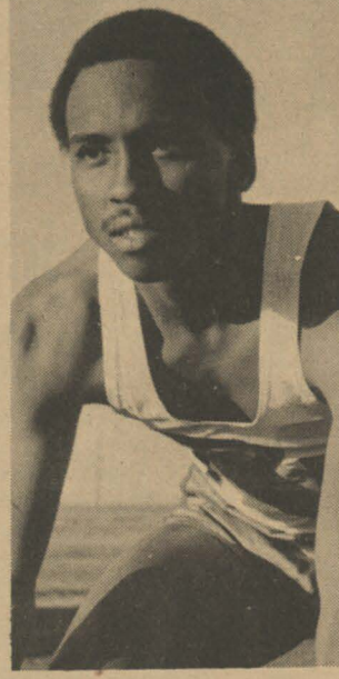
Newhouse make World's Record in Paris