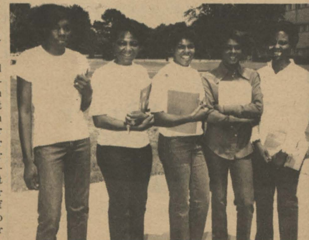
Lee's aren't just for Saturday nights.