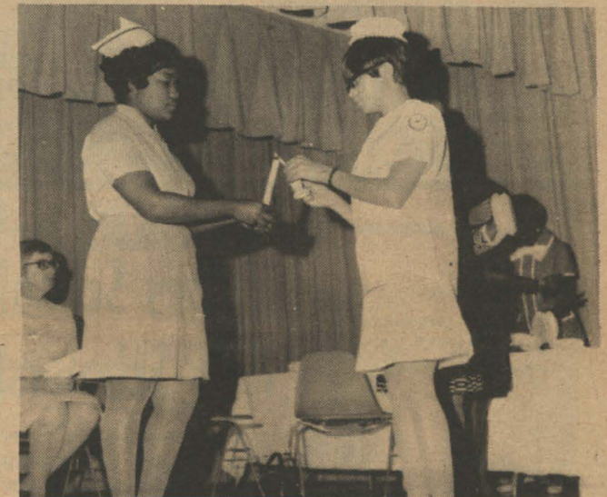
A scene from the Nursing Capping Ceremony, Sunday, September 27, 1970.

Another grant was given to the School of Engineering. This $15,000 grant was a gift from the Ford Motor Company of Dearborn, Michigan.