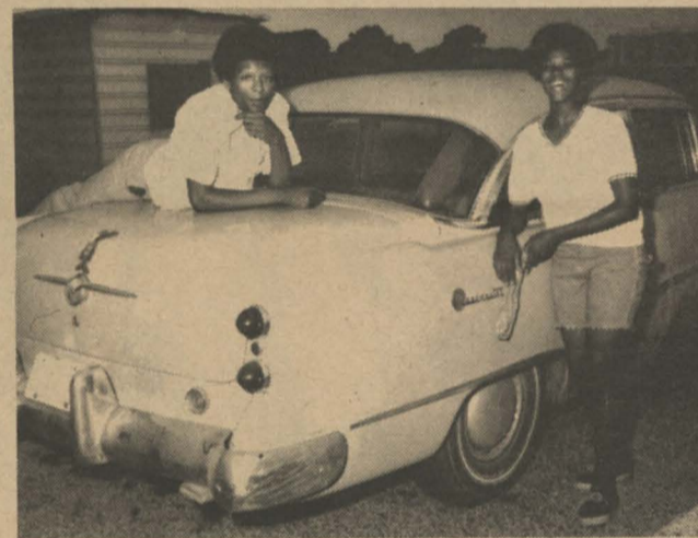
Wrangler (W), into things ...