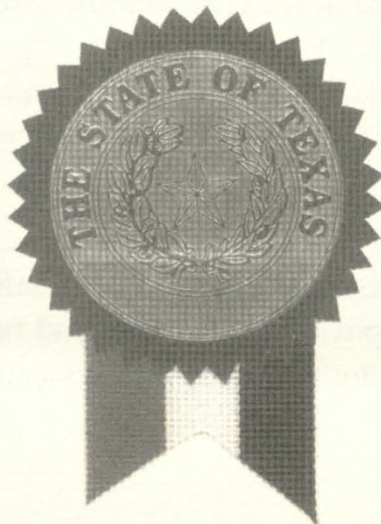
Rick Perry Governor