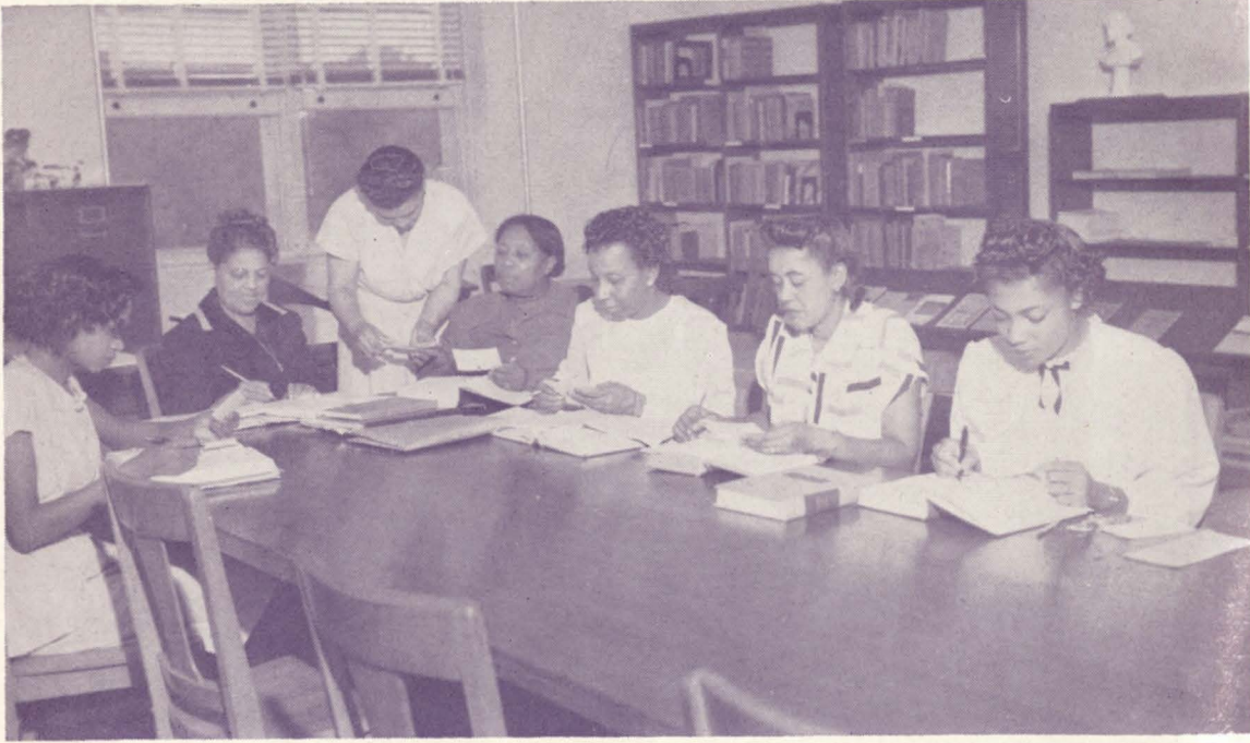
Class in Library Science Education