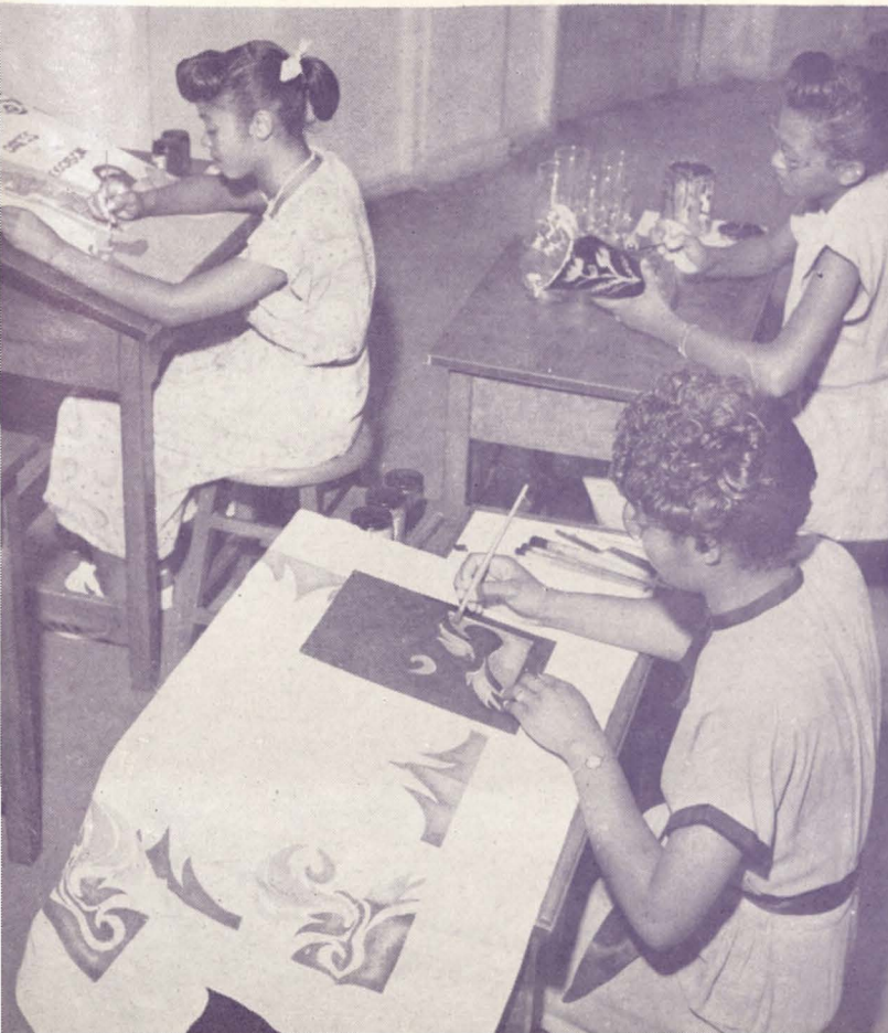
Application of Art to Home Problems