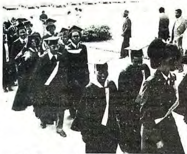
GRADUATES — A large percentage of PV students graduate with their class. This is one of the goals of Operation Success.