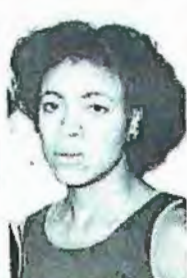
Patricia Jackson Track