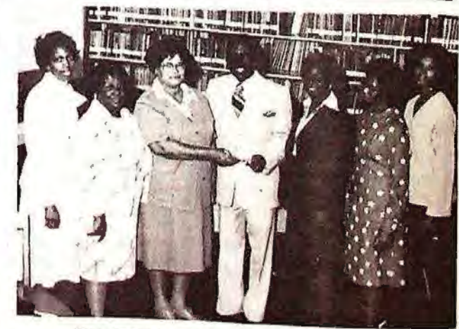
AKA SUPPORTS ALL-FAITH CHAPEL