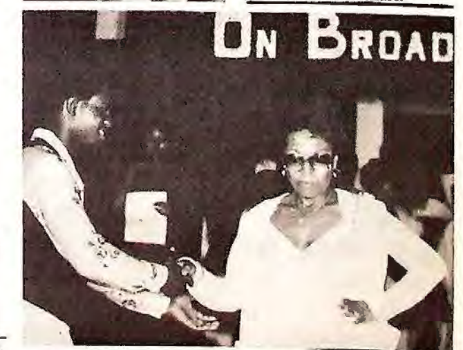
SCENES FROM "COSMETOLOGY FASHION SHOW"