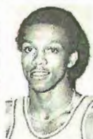
Evans White Track