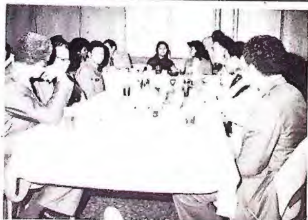
TEAM WORK — Student leaders, and University administrators are pictured during working luncheon.