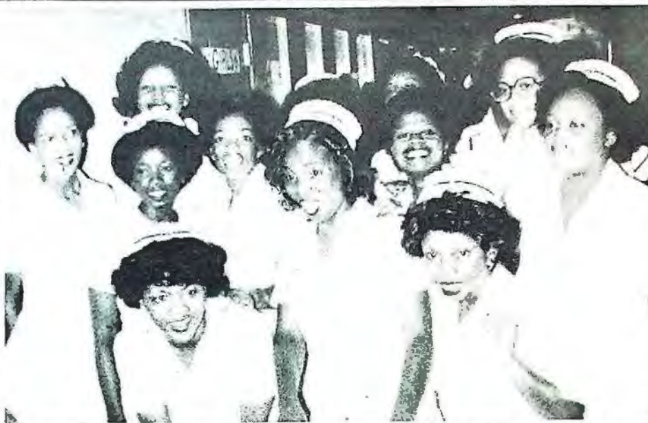
NURSING GRADUATE — This group of recent grads from the College of Nursing pose in happy mood following exercises at Houston Clinical Center.