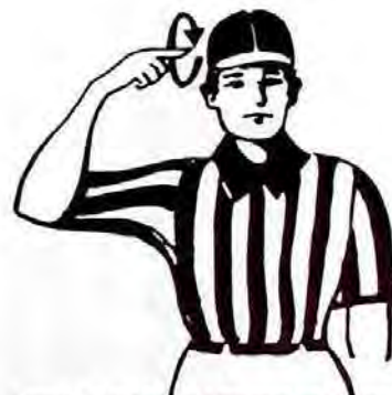
Signal for "M&M's"® Peanut Chocolate Candies. Move finger in clockwise motion pointing toward head. Go crazy for the peanut chocolate candies. "The milk chocolate melts in your mouth—not in your hand."