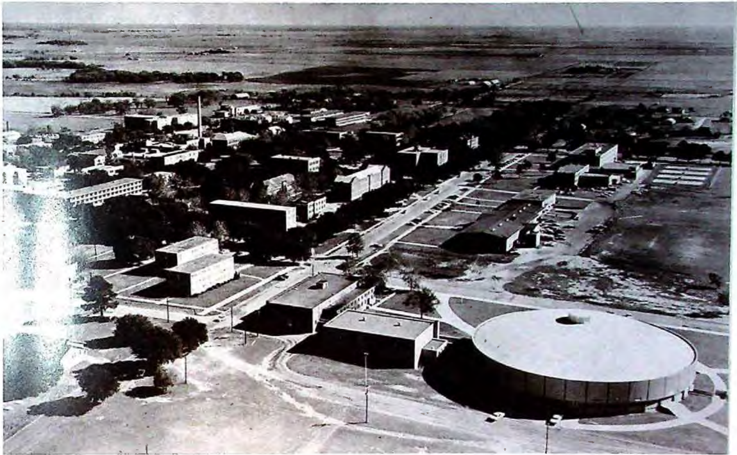
AERIAL VIEW OF PRAIRIE VIEW A&M CAMPUS