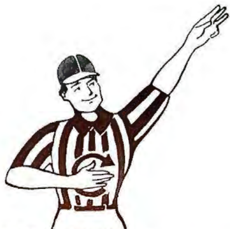
Signal for 3 MUSKETEERS® Bar. Look up and point with three fingers while right hand rubs stomach. It's the fluffy chocolate bar that gives your spirits a lift.