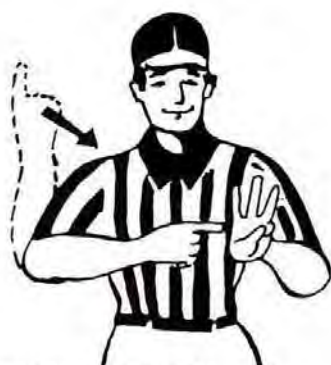
Signal for MILKY WAY® Bar. Raise three fingers of left hand while pointing with right. Get three great tastes in one great bar.