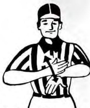
Signal for SNICKERS® Bar. Left palm extended, while right hand makes three chopping motions. No matter how you slice it, it comes up peanuts.