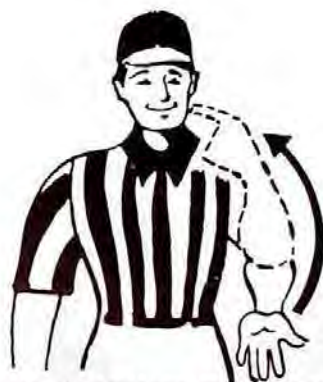
Signal for "M&M's"® Plain Chocolate Candies. Alternate left palm extended with lifting and pointing to mouth. "The milk chocolate melts in your mouth—not in your hand."