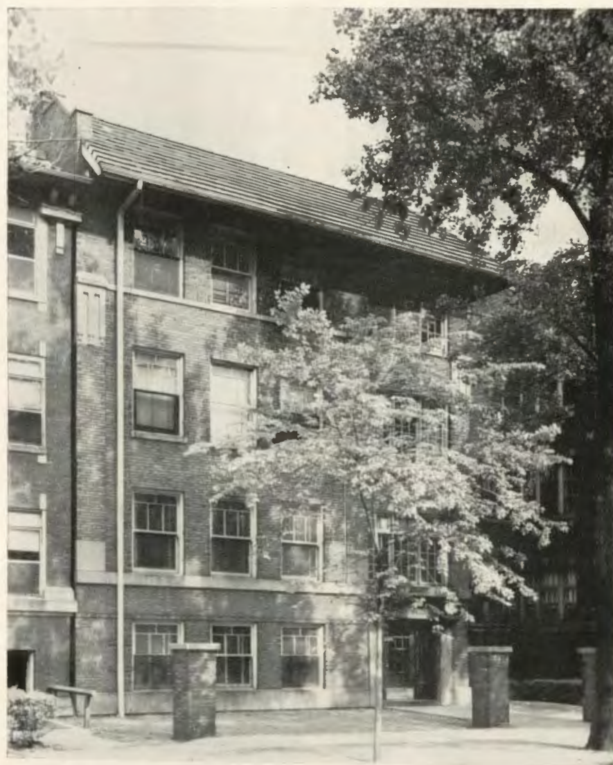
5211 South Greenwood Avenue, Chicago, Illinois