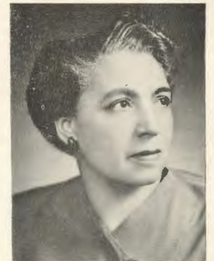
DOROTHY BOULDING FEREBEE Tenth Supreme Basileus