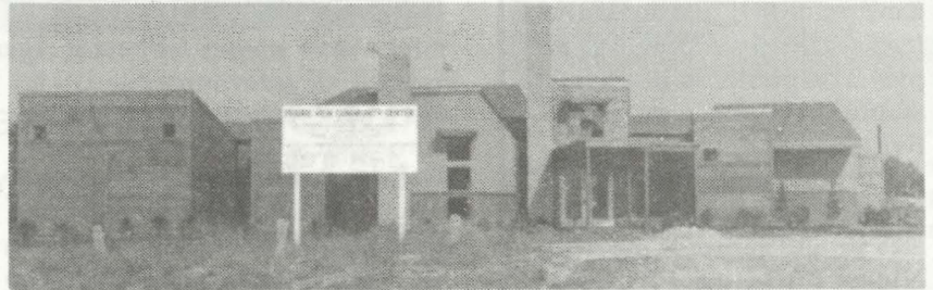
New Waller County Community Center