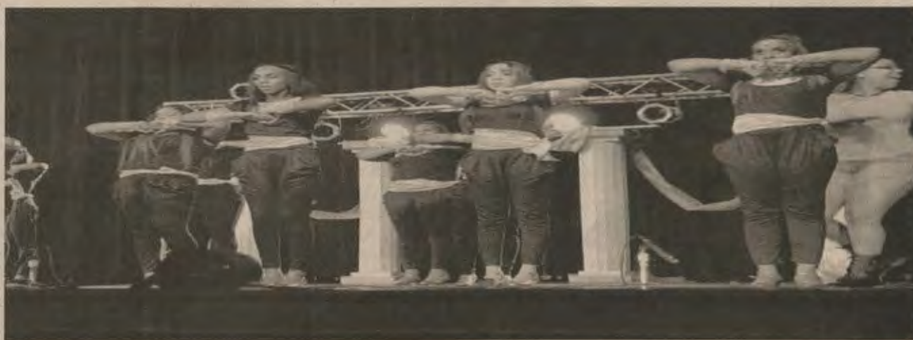
Girl building in the University College step show dressed in nice costumes to compete for first place.